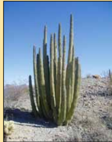
Organ Pipe Cactus